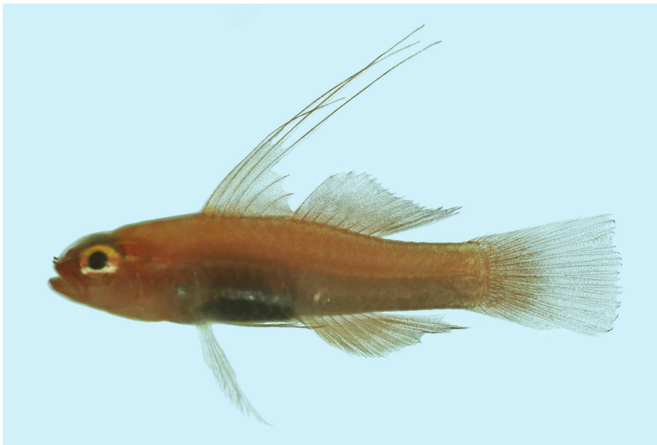
FIGURE 6. Eviota atriventris , fresh holotype, ROM 76339, 17.1mm SL.

upper jaw. Nape just behind eyes with a slight dusky area (most paratypes have distinct lines on the nape extending back from the eyes; one behind the PITO pore and one on each side towards the SOT pores –Fig. 8). Pectoral and pelvic fins clear.