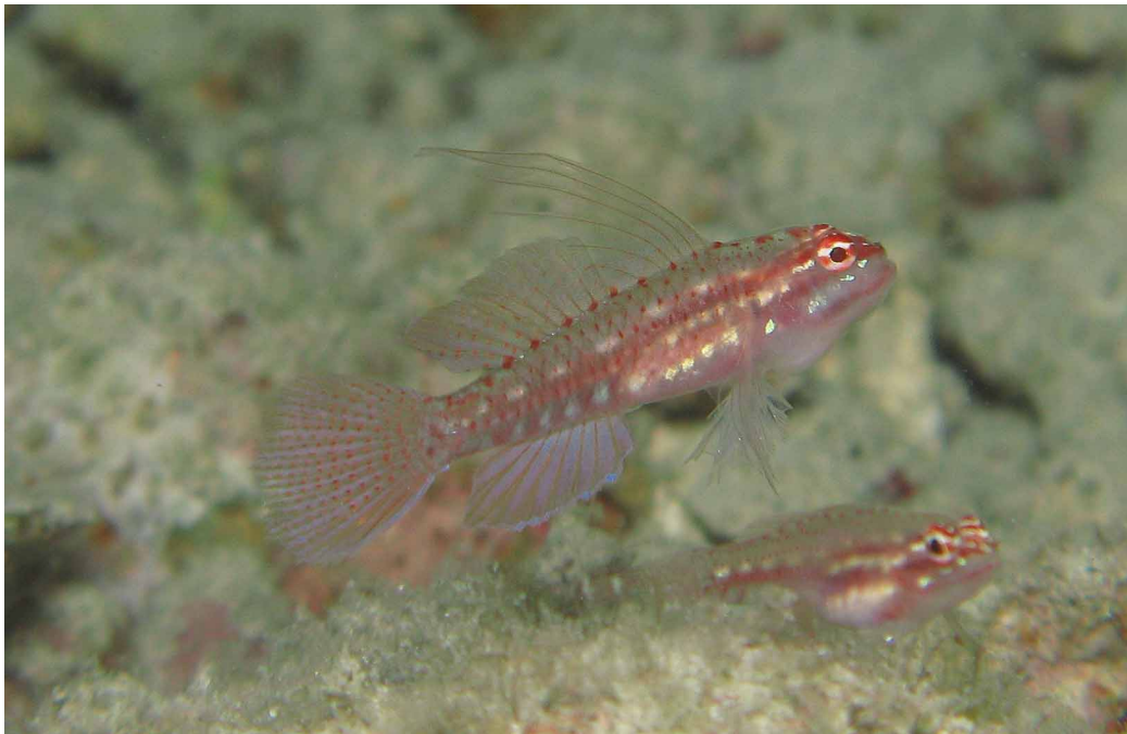
FIGURE 3. Underwater photograph of Eviota pellucida , male, Amami-oshima Island, the Ryukyu Islands, Japan.

Diagnosis. The following combination of characters distinguishes E. atriventris from congeners: Abdomen with black peritoneum that is clearly visible externally; dorsal/anal formula 8/7; pectoral-fin rays simple; length of 5 th pelvic-fin ray 40% or greater of 4 th ray; genital papilla in male not fimbriate; cephalic sensory-pore system pattern group 2 (only IT missing).