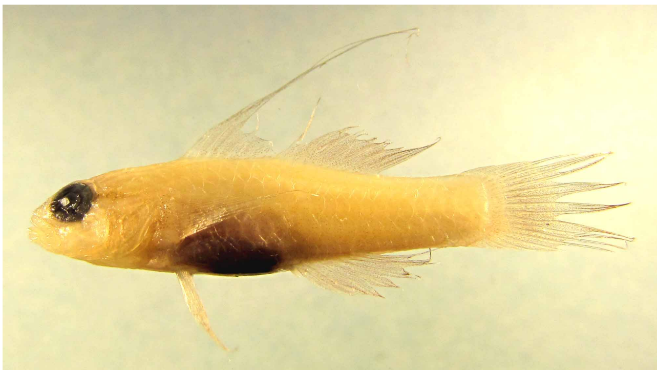
FIGURE 7. Eviota atriventris , preserved holotype, ROM 76399, 17.1 mm SL.