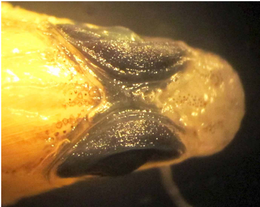
FIGURE 8. Eviota atriventris , head of CAS 233514, paratype, 13.5 mm female.

Color in life (Fig. 1). Background color of body a translucent red-orange. Abdomen black with a bright white horizontal line crossing the center of the black area. A narrow golden line running from the top of the head just above the vertebral column back to the caudal-fin base. Anterior end of this line splitting into two lines extending forward to the eyes. A narrow golden line running from the tip of the snout back across the eye just above the pupil and onto the body above the black area of the abdomen, ending at back of black area. Another short, narrow golden line on eye just below pupil. Ventral surface of body from anal-fin origin to caudal-fin base with a narrow golden line. Ventral surface of head and belly a pale translucent cream. Rays of all fins red-orange, membranes with fine dark chromatophores.