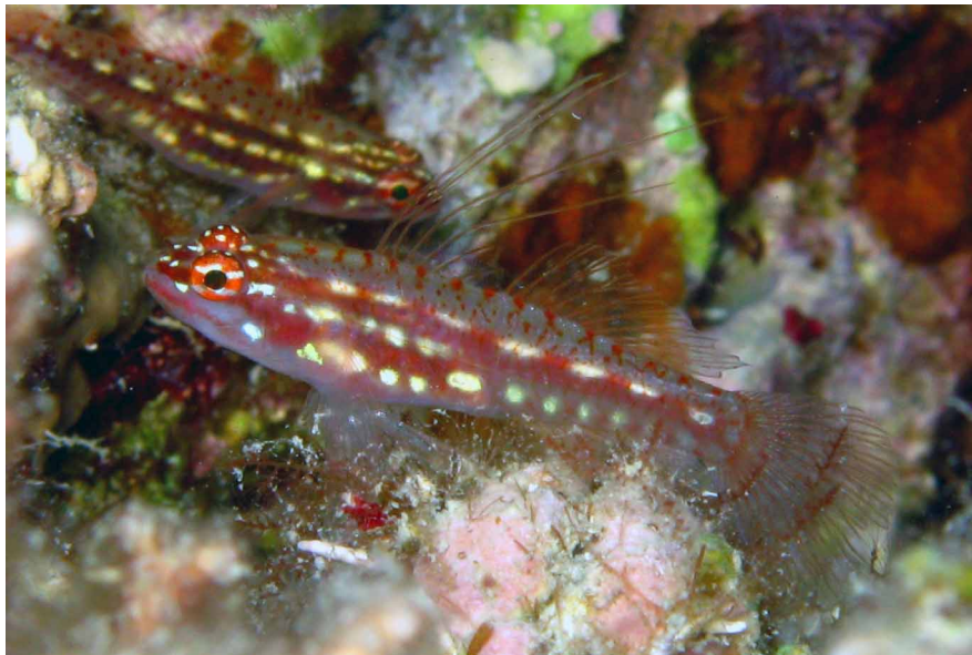
FIGURE 10. Underwater photograph of Eviota prasites , male, Amami-oshima Island, the Ryukyu Islands, Japan.