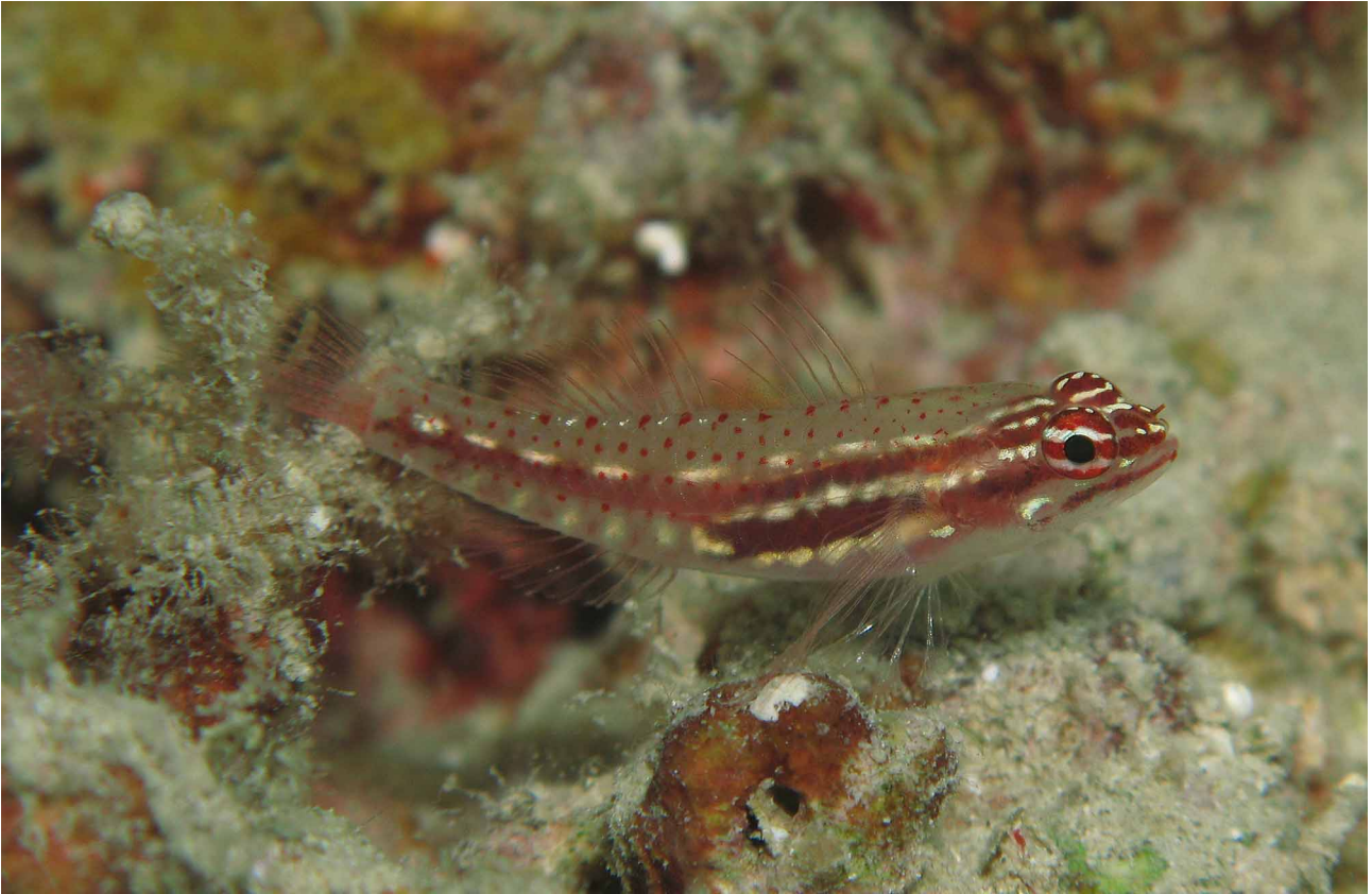
FIGURE 4. Underwater photograph of Eviota pellucida , female, Amamki-oshima Island, the Ryukyu Islands, Japan.

Measurements (based on holotype and nine paratypes, 13.9–18.2 mm). Head length 31.0 (29.8–33.9, 32.0); origin of first dorsal fin 35.1 (33.9–36.9, 35.7); origin of second dorsal fin 55.5 (54.9–60.1, 56.8); origin of anal fin 55.5 (55.5–66.5, 61.0); caudal-peduncle length 24.4 (24.3–28.4, 25.9); caudal-peduncle depth 15.8 (12.0–15.8, 14.1); body depth 25.4 (22.0–27.2, 24.3); eye diameter 11.1 (10.4–12.9, 11.2); snout length 5.3 (4.3–6.3, 5.3); pectoral-fin length 35.1 (30.7–36.1, 33.6); pelvic-fin length 30.4 (27.4–36.0, 32.0).