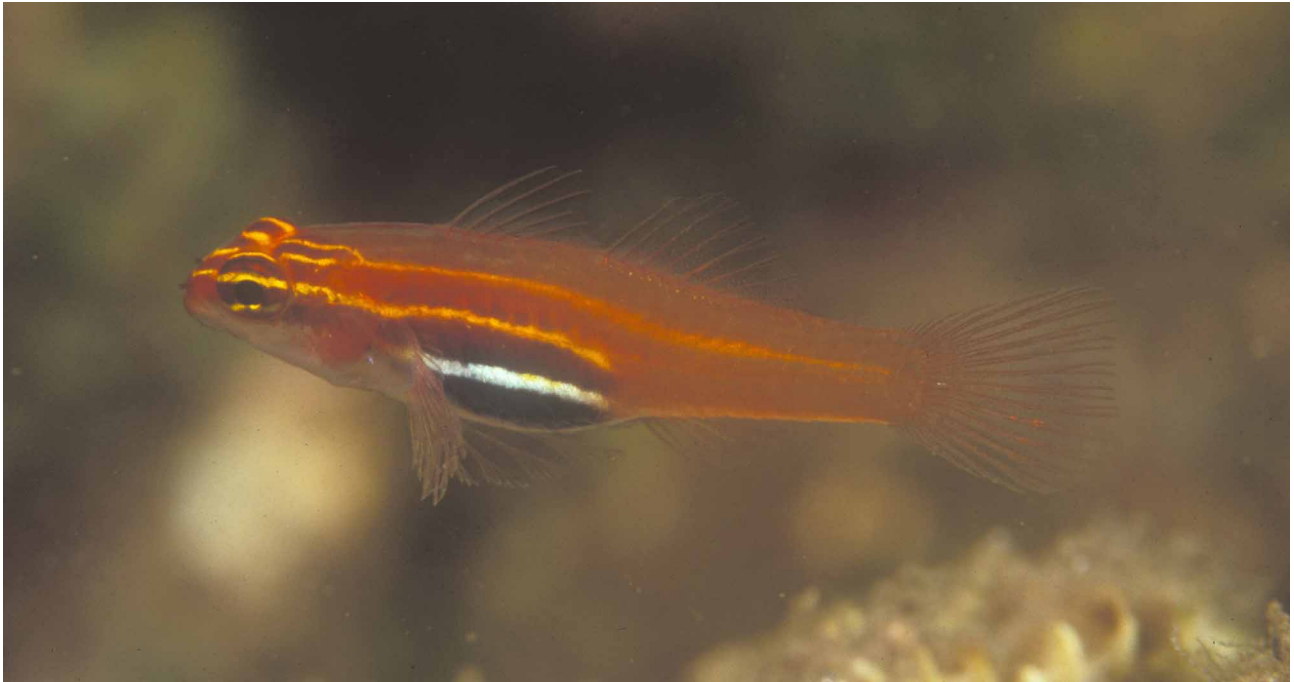
FIGURE 1. Underwater photograph of Eviota atriventris , Flores.

Holotype: ROM 76339, 17.1 mm male, Palau, due west of Koror where lagoon rises to outer barrier reef, 07°20'44.3" N, 134°16'47.2" E, 0–7.9 m, patch reef of numerous Porites bommies, rotenone, field number RW04-12, R. Winterbottom, W. Holleman, B. Hubley, and D. Winterbottom, 24 May 2004.