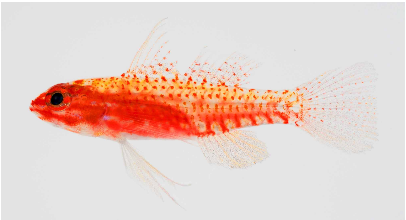
FIGURE 2. Eviota pellucida , OMNH 35616, Ishigaki-jima Island, Ryukyu Islands, Japan.